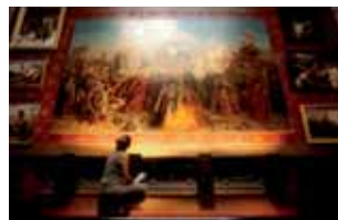
The Museum Grand Salon

• Jules Verne married a woman from Amiens in 1857 and settled in Amiens definitively by 1871. He was then 43 years of age and he wrote most of the works that made him famous. The house where he lived, renovated in 2005, holds many mementos of his life and his work. He took an active part in Amiens public life and in 1889 he inaugurated the circus that now bears his name. He is buried in the Madeleine Cemetery.