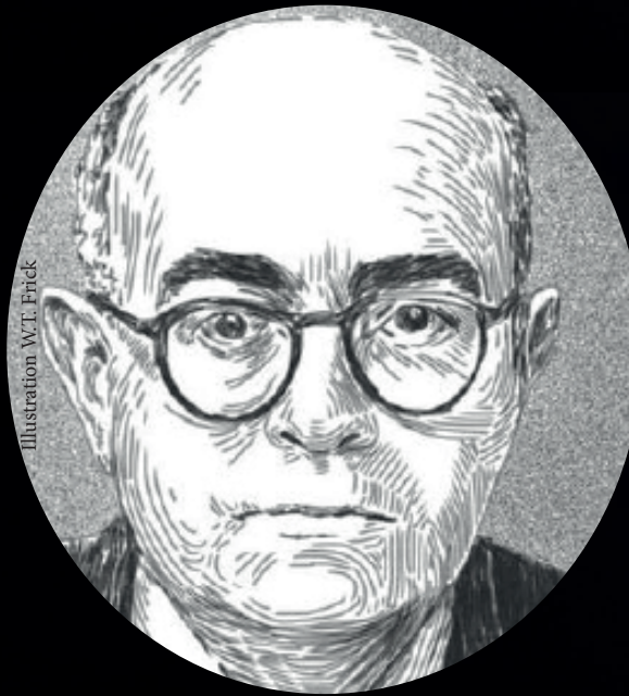
Illustration W.T. Frick